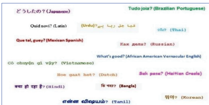
Figure 4 — Classroom Language Landscape

Heejin: Your “classroom language landscape” activity is an excellent instantiation of creating a welcoming and engaging dialogue among class participants, instigating critical reflection on English(es) and ELT throughout the course. I am curious to hear more about the discussions that this activity invoked.