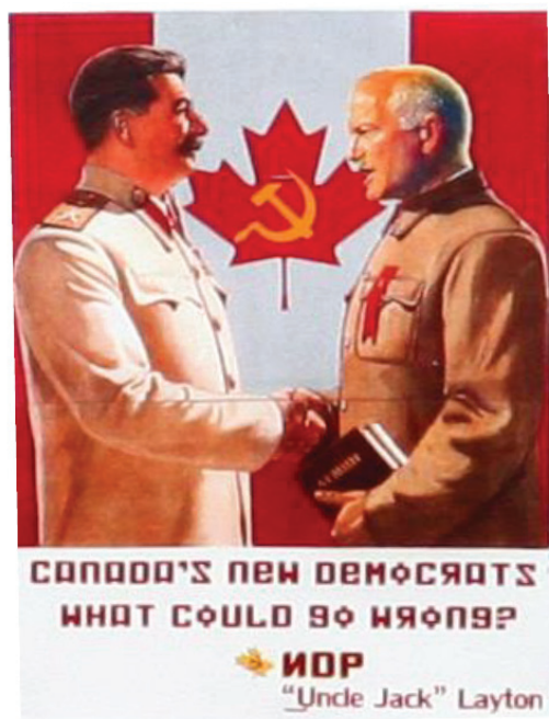
Figure 5 — Culture Jamming Ad

For the next class, I ask students to bring in one or two assignment examples and ask them to do a short, informal presentation focused on reasons for their choice and emergent analyses based on course readings. The group discussions around this activity are especially useful for raising intercultural, plurilingual and trans-semiotic awareness.