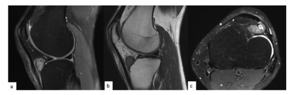
Fig. 1 Images of the relative isointensity in the sagittal plane on T2 (a), T1 (b) and axial plane on T2 (c).

capsule, with only three cases described in the literature of tendon sheath tumors emerging from the infrapatellar Hoffa sheath.<sup>5</sup> The authors present a case of a fibroma of the patellar tendon sheath at the intra-articular level.