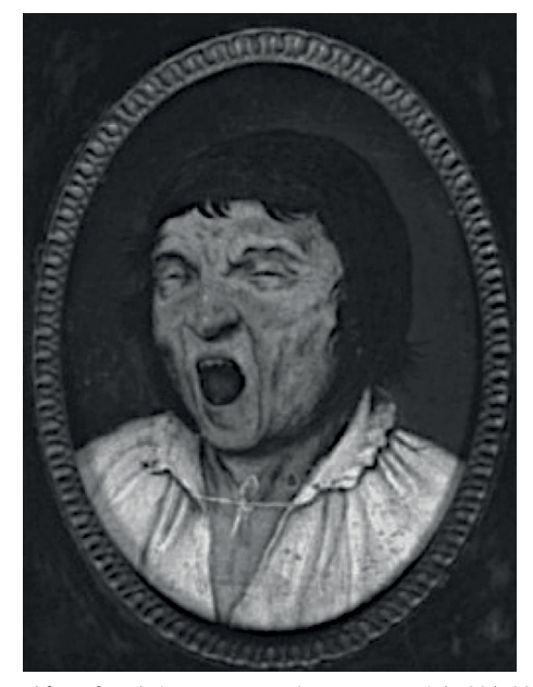
Figure 1. The Yawner. Pieter Bruegel. The Elder.

Yawning is considered an intriguing and fascinating phenomenon with an obscure etiopathogenesis. It involves opening the mouth wide and closing the eyelids while inhaling deeply and then exhaling more briefly. A yawn typically lasts 5-10 seconds (Figure 1)<sup>1,2,3,4,5,6,7</sup> and is usually accompanied by retroflexion of the head and sometimes by elevation of the arms (known as pandiculation when occurring together). Human beings yawn with a frequency of up to 28 times a day<sup>1,2,3,4,5,6,7</sup>, often after waking up and before falling asleep. Yawning is frequently contagious and is considered a sign of boredom or even disrespectful behavior in the presence of others<sup>8,9,10</sup>. In the 19<sup>th</sup> century, Charcot considered yawning an important clinical neurological sign, but for many years neurologists attached little importance to it<sup>8,11</sup>. Nowadays, however, although yawning continues to be a largely under-appreciated behavior, chasmology, the study of yawning, has become the focus of considerable interest<sup>12</sup>. The aim of this article is to review yawning in neurology.