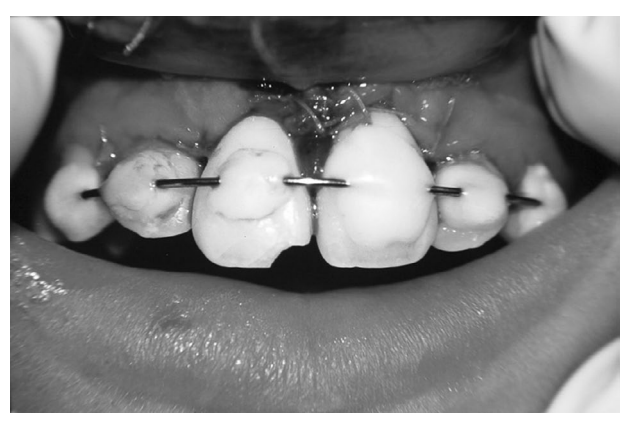
Figure 2. Clinical view showing the repositioned teeth with lightcuring resin and orthodontic wire as well as sutured gingival tissue.

Pulp necrosis is an important consequence of luxation injuries and its development depends on the type of injury and the stage of root maturation. It is most frequent in mature teeth compared to teeth with open