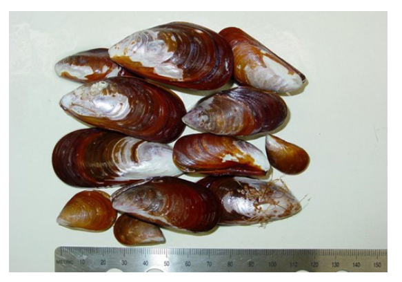
Figure 1. Brown mussel used in laboratory bioassays.

Seaweeds were stressed before being extracted, with the results compared to control macroalgae to see if defensive induction occurred. The induction of herbivore was carried out similarly as reported in previous studies (Jormalainen and Honkanen, 2008; Molis et al., 2008), with stressed macroalgae being cultivated in the lab for a week and then subjected to amphipod grazing before being extracted. With the exception of herbivores, control macroalgae were cultivated under the identical circumstances. Similarly, at the same time a Cryptonemia seminervis (Red seaweed) was identified both without and with the epibionts, and they were evaluated to see if the existence of epibionts elicited a defensive reaction. The brown mussel was used to evaluate pure chemicals and extracts in laboratory bioassays (Figure 1) (Galvao et al., 2015; Cortez et al., 2018; Lins and Rocha, 2020).