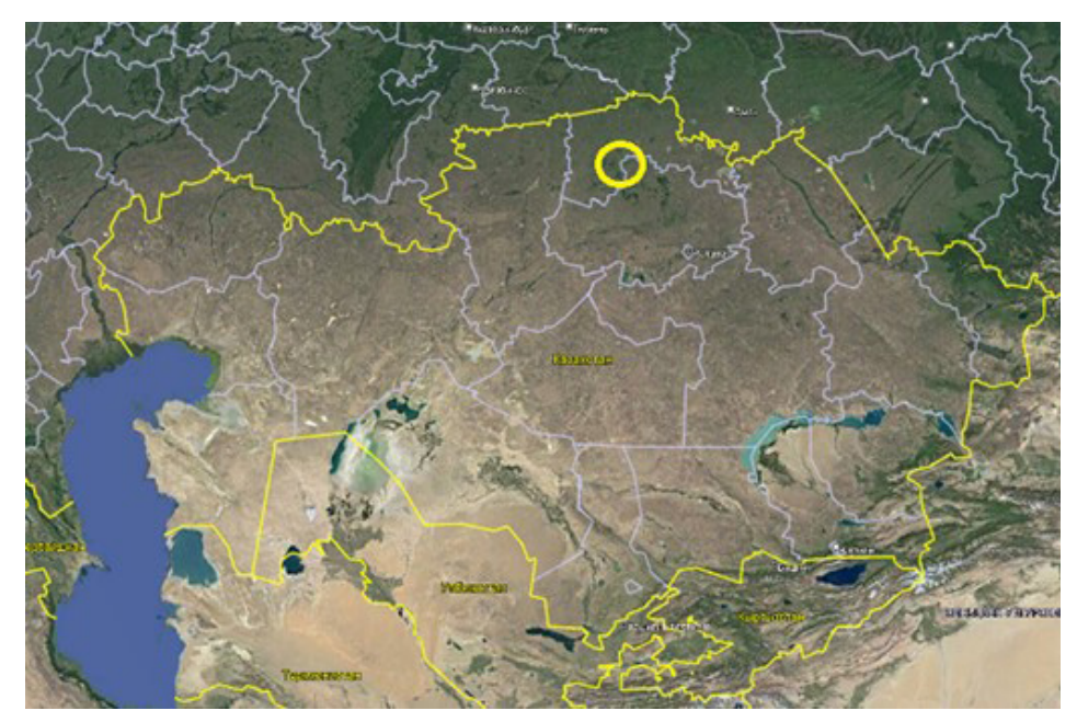
Figure 1. Satellite view of the location of the Grachevsky uranium deposit in Kazakhstan. The Grachevsky deposit is marked with a yellow circle.