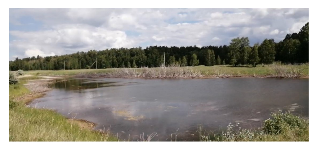
Figure 2. General view of the reservoir.