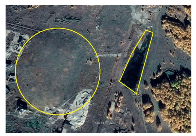
Figure 3. Satellite view of the reservoir and waste dump. The reclaimed waste dump is highlighted with a yellow circle. The reservoir is located in the image to the right of the dump and its borders are also highlighted in yellow.

72% of the possible total radiation reaches the Earth's surface. The sunniest months are May, June, and July when the average sun shines during the day for 9.9-10.6 hours. The solar radiation resources in this region are sufficient for long-day plants and optimal crop life (Baisholanov, 2017).