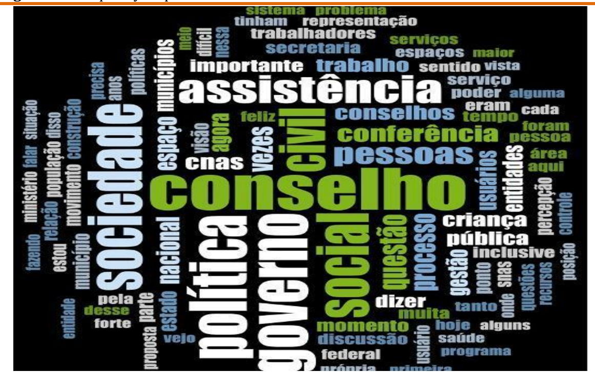
Figure 01. Frequency map: words that the interviewees mentioned the most

The word frequency map was based on the content of all the interviews (Figure 01). As expected, the most frequent words were policy, assistance, society, government and participation, as well as Council. This tells us that although the questions asked had to do with social participation in a broad sense, the National Council for Social Assistance (CNAS) constantly appeared in the answers, which reaffirmed its central role in the process of building social assistance policy.