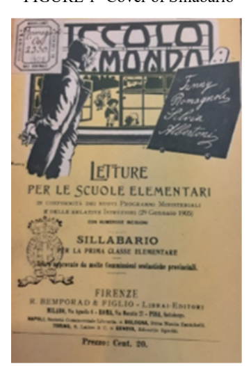
FIGURE 1- Cover of Sillabario