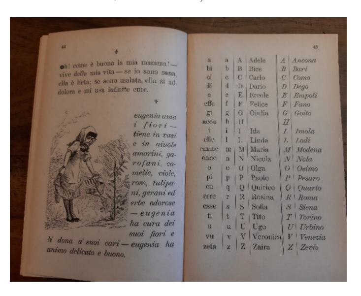
FIGURE 7- Table of sounds, letters and words.