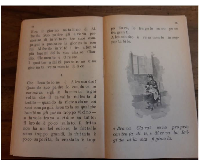
FIGURE 5- The lesson of "q"