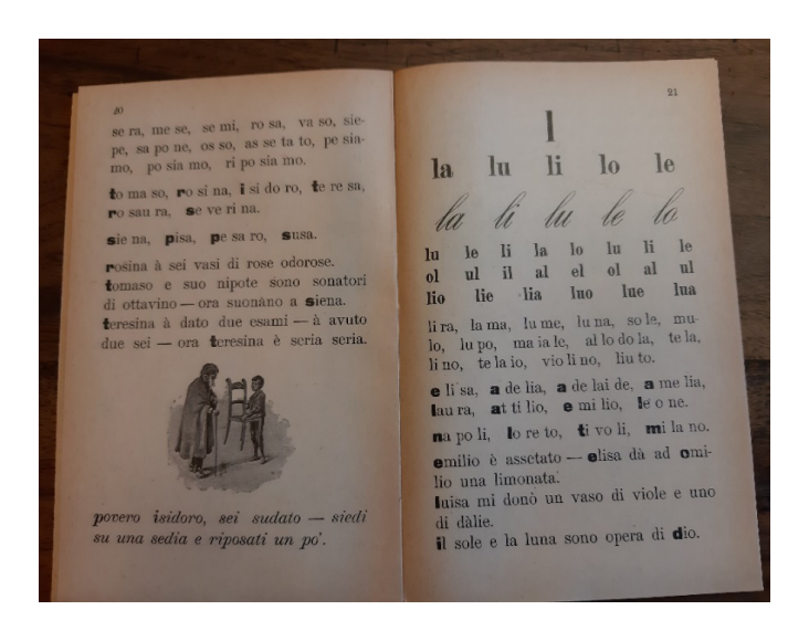
FIGURE 4- The lesson "l"

will be expanded, making them, therefore, capable of intensifying their dedication to reading. Thus, while in the first lessons there were 2 to 4 short sentences of one or two lines, from lesson "1" onwards, in addition to sentences, very short stories are presented, but with a connection between the sentences, as seen in the Figure 4.