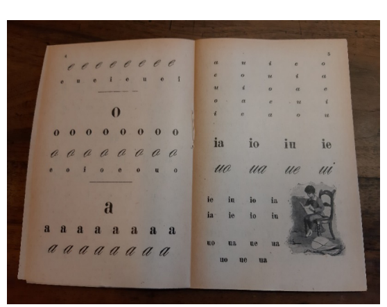
FIGURE 2- Vowels and vowel combinations

The Sillabario , indicated to be the first book of the first class of the elementary course, introduces future readers to the literate world through the presentation of the vowels, "i, u, e, o, a" and, in the sequence, the vowels beginning with "i" and with "u". All letters are presented in printed and cursive, as shown in Figure 2.