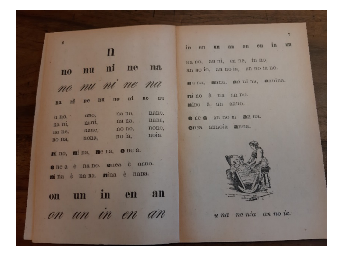
FIGURE 3- The "lesson" n

Another highlight of the "lesson" is the use of bold in several letters, mainly, but not exclusively, in the letter "n" that is being taught, but always in the first letter of the word, as seen in Figure 3.