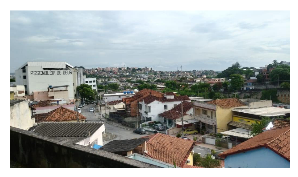
Figure 2. View of Brás de Pina from Ruth's house

The theme of first photo that Ruth showed me was the home and housing (Figure 2). The structure of the walls and roofs is one of the layers that represent the house. But she went further. It is in the home where memories are kept, where ways of being in the world are hidden. At home, refugees have their sense of belonging, of fixing their trajectory.