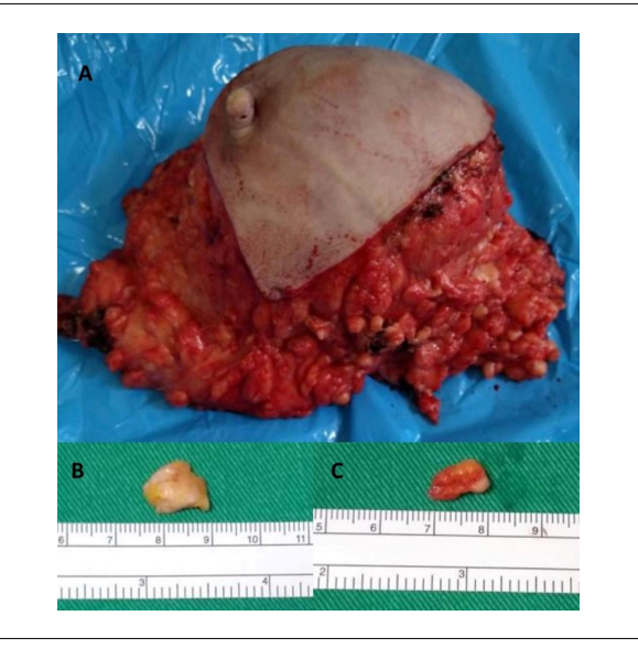
Figure 2. A) total breast section; B) tumor fragment; C) fragment of tumor-surrounding tissue. The top of the ruler is graduated in centimeters.

Figure 1. Methylation of the human telomerase reverse transcriptase ( hTERT ) gene. Numbers correspond to patients. A) tumor; B) tumor surrounding tissue; C) blood of the first collection; D) blood of the second collection.