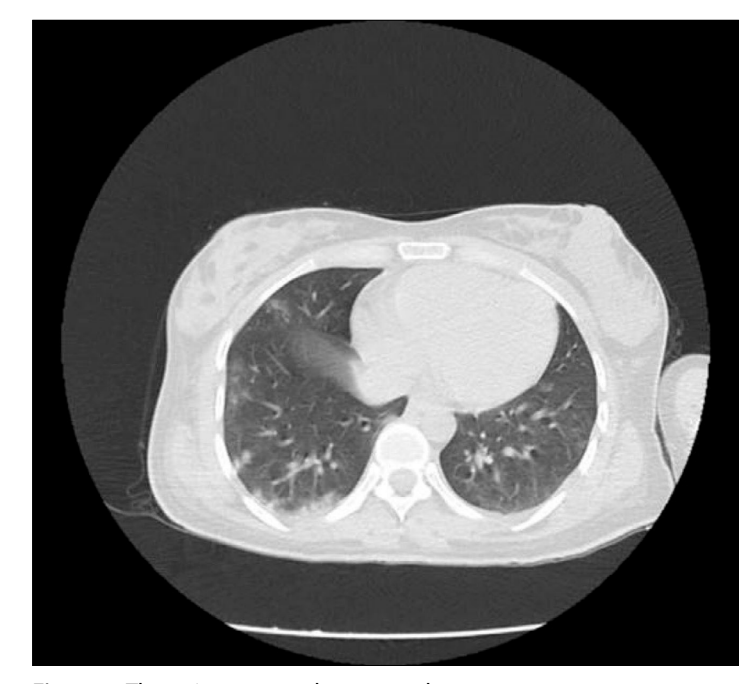
Figure 3. Thoracic computed tomography.

Subsequently, the patient's postpartum headache complaints decreased and her speech became fluent without any change in muscle strength deficit. Her thrombocyte counts decreased to 67,000/mm<sup>3</sup>. Anticoagulant therapy was continued, with peripheral smear follow-ups. Thoracic computed tomography was performed on the patient, who did not present respiratory distress, and the findings were compatible with COVID-19 pneumonia after birth ( Figure 3 ). There was an increase in infection parameters, and the patient was started on hydroxychloroquine and ceftriaxone treatment.